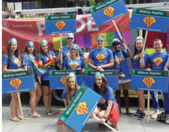
Mildmay Heroes Pride 2015