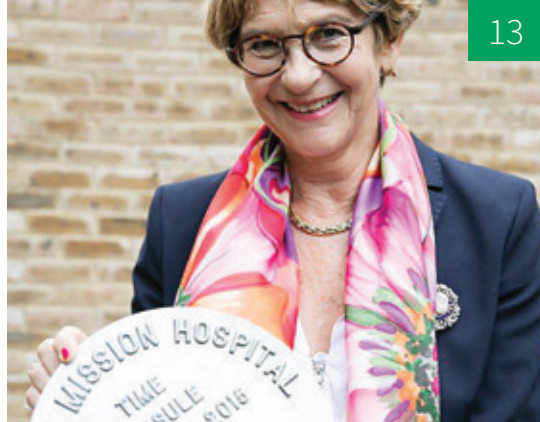
Mayor of London at Mildmay Time Capsule ceremony