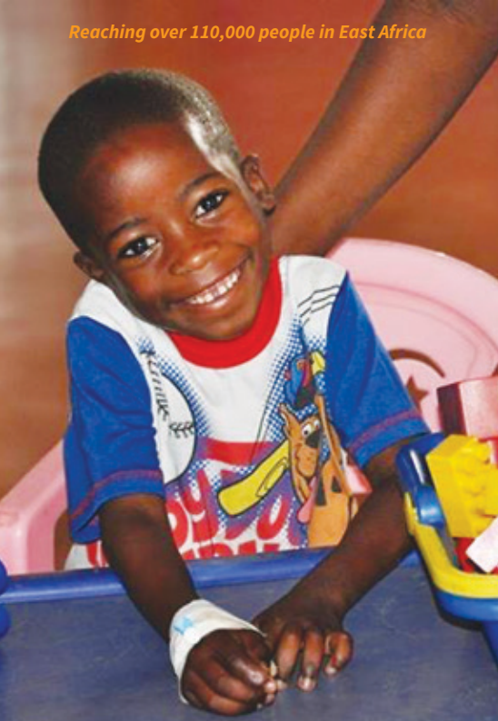
Reaching over 110,000 people in East Africa