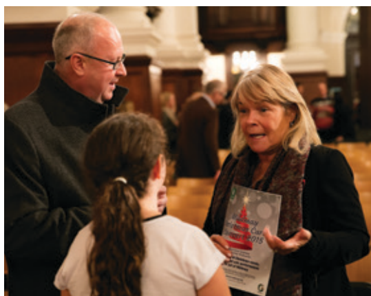
Linda Robson becomes a Mildmay patron