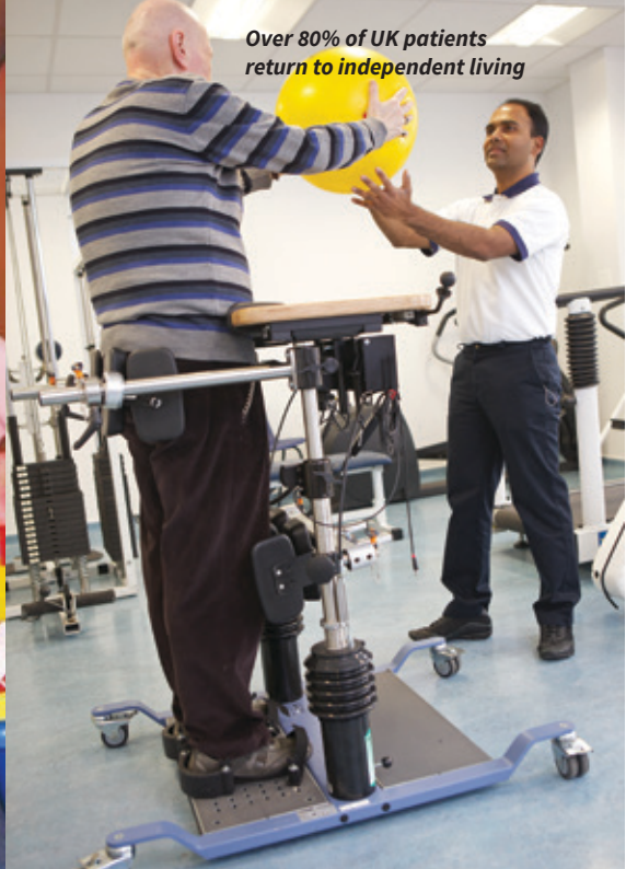
Over 80% of UK patients return to independent living