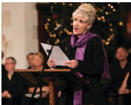
Our new patron Anita Dobson at our carol concert