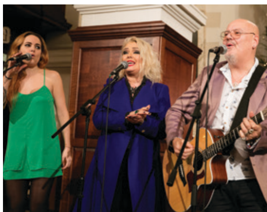
Kim Wilde rocking around the Christmas Tree Mildmay carol concert