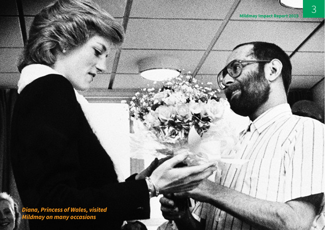
Diana, Princess of Wales, visited Mildmay on many occasions