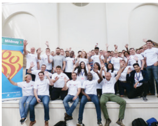
CheckPoint raise funds for Mildmay's new garden